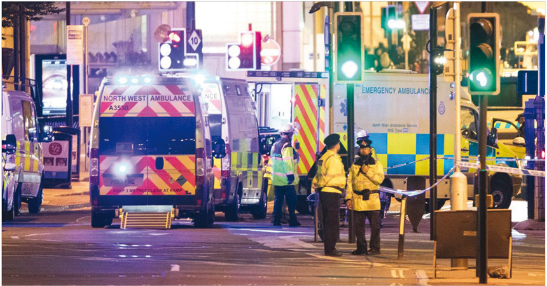
Police in the aftermath of the Manchester Arena bomb.

Recognising the sheer scale of the explosion, the BTP sergeant present at the scene realised the potential vulnerability if there was a follow-on attack such as a marauding terrorist attack and or a secondary IED.