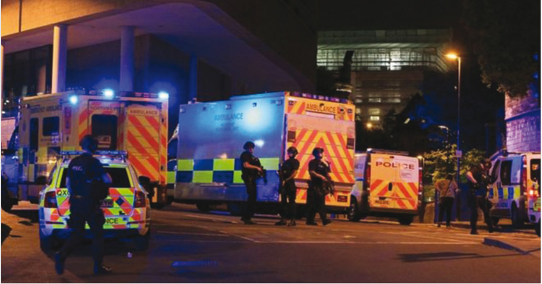
Armed Police at the scene.

Duty Officer to suspect that a 'Paris-style' attack was in progress. Acting on this information he declared that Operation PLATO contingency be deployed. Developed by the UK's Home Office and emergency services, at the time of this attack Operation PLATO was the contingency plan for dealing with a marauding terrorist attack. A marauding terrorist attack is a fast-moving attack where the terrorists, armed with firearms, move through a location aiming to find and kill or injure as many people as possible.